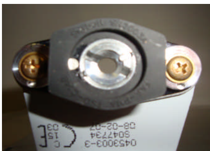
SK2003-AW5 CamWashers set at "Center Default Position"

*SK2003-AW5S includes 2 ea CamWashers, 1 drilled shim.