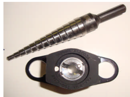
SK2003A Series Mount drilled to 7/16 with Unibit-1 Stepdrill

*SK2003-AW5S includes 2 ea CamWashers, 1 drilled shim.