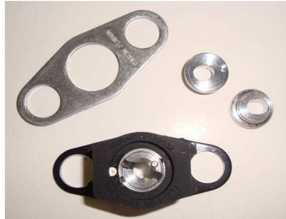
SK2003-AW5S Components shown with modified SK2003A Series Platemount

Also new for 2010 is the Skybolt SK2003-AW5 Series Alignment Washers or CamWashers. Our latest innovation in cowling alignment features a "neutral default center" CamWasher. Unlike the 1st generation camwasher we developed in 2002, this design allows the installation to begin with a "centered" orientation. Previous designs never had a default center, thus limiting adjustment options. Using the Skybolt developed alignment template SK203-TEM1, it is very simple to set the mount location to the exact center of the respective cowling fastener location. Simply modify any Skybolt SK2003A Series Mount for the CamWashers, install, and "dial" the location of the Platemount as determined by the template. No complex drilling of any aircraft components is required to perfectly align any Cessna cowling.